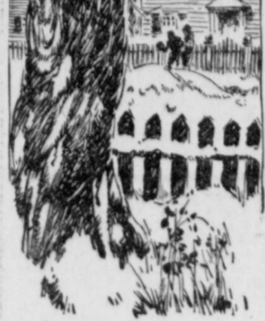
They walked, arms linked, along the cleared pavement.