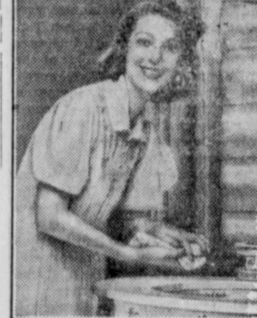
LORETTA YOUNG 20th Century-Fox Star

Bell's Flower Shop PHONE 350—"SAY IT WITH FLOWERS"