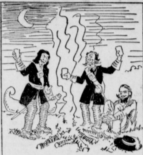
THE NIGHT AFTER THE RAID THE FRENCHMEN LAUGHED AT THE EASE WITH WHICH THEY STOLE FROM THE INDIANS