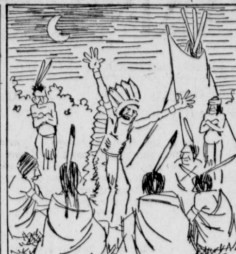
IN THE MEANTIME THE INDIANS HELD A POW-WOW