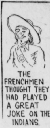
THE FRENCHMEN THOUGHT THEY HAD PLAYED A GREAT JOKE ON THE INDIANS.