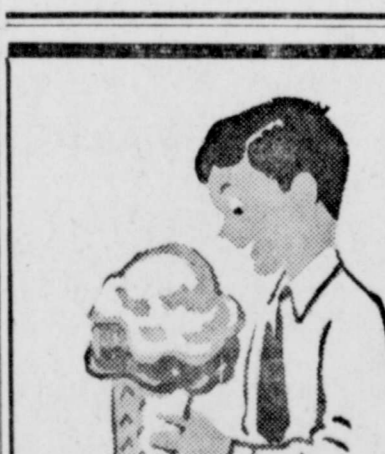
A Portrait . . . of JUNIOR staring goggle-eyed at a Magnificent, Enormous and Colossal Double Dip Cone from Irwin's. And to think that all it cost was

BLACK-DRAUGHT People who have taken Black-Draught naturally are enthusiastic about it because of the refreshing relief it has brought them.