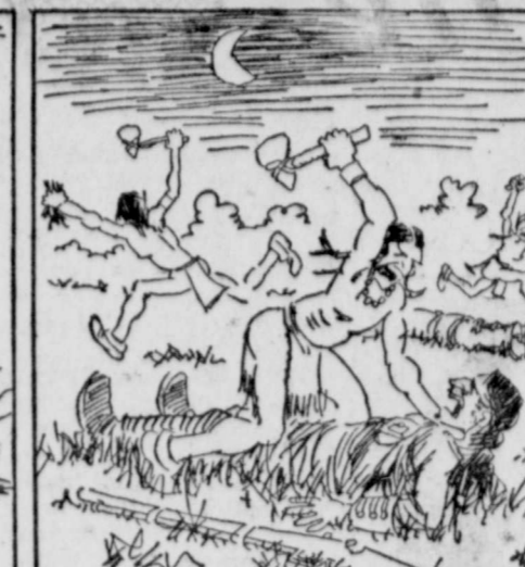
THE INDIANS KILLED TWO AND WOUNDED TWO, ONE OF THEM LA SALLE'S NEPHEW.