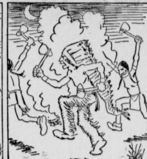
THE INDIANS DECIDED WHAT TO DO