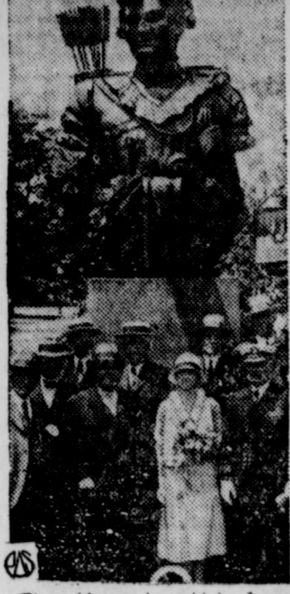
The old wooden ship's figurehead, a likeness of Tecumseh, the Indian Chief, which stood for years on the grounds of the U. S. Naval Academy at Annapolis, has been replaced by this bronze duplicate.