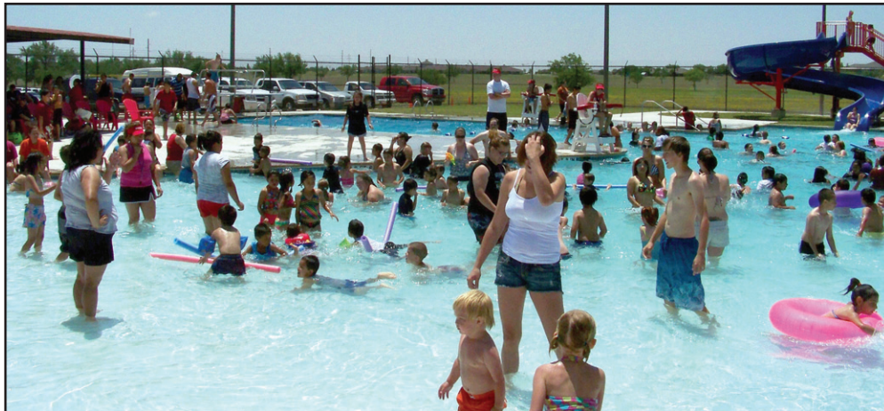
Water park opens — Memorial Day 2010's high temperatures made the opening of Muleshoe's new water park "the place to be."

While the ban will allow certain activities, such as the use of enclosed barbecue grills, and will allow welding under certain