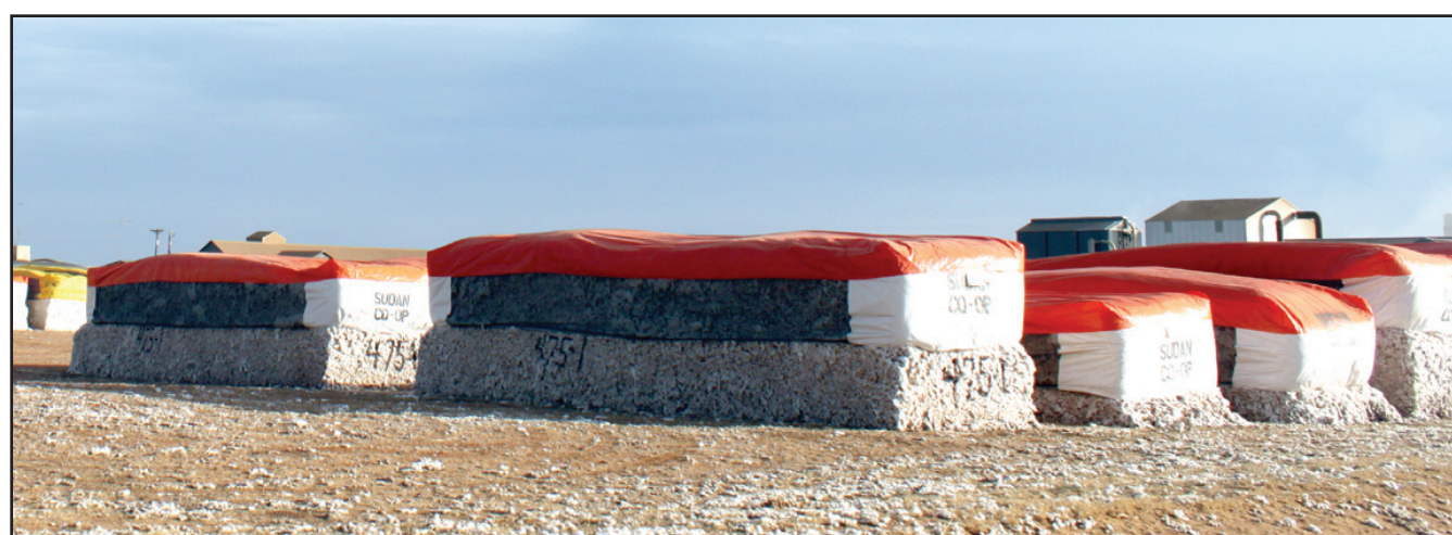
Cotton modules at the Farmers Co-Op Gin in Sudan