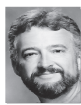
Focus On Faith Curtis Shelburne

I like living in a place where weather-wise, they are pretty obvious. It's strange. I don't tend to like change, but I like the changing seasons.