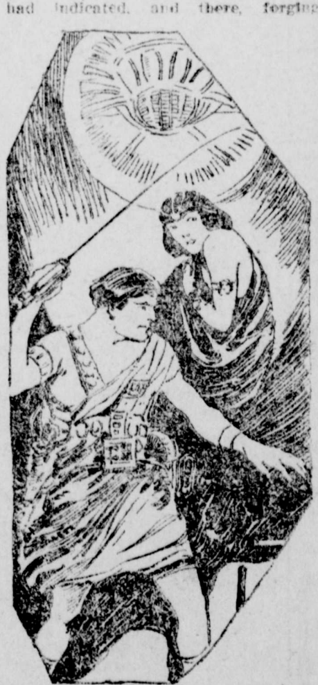
With My Back Against a Golden Throne I Fought Once Again for Dejah Theris.

"Zedanga has fallen." I cried All eyes turned in the direction