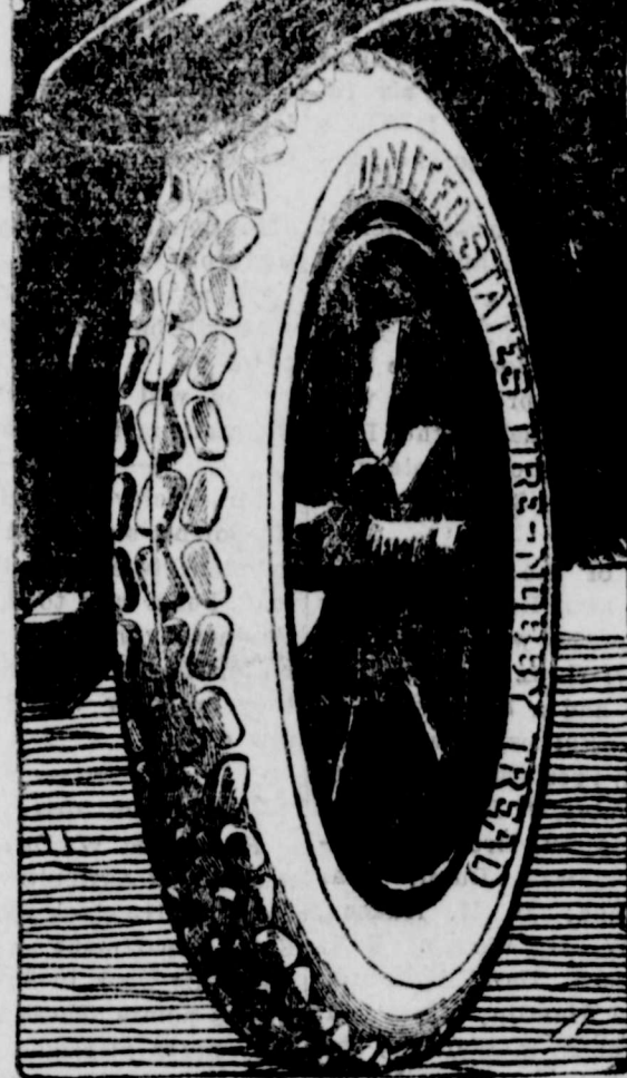
THE U. S. NOBBY TREAD

Giving the same quality, selection and price-advantage to the owner of the medium weight car as the big car owner gets. With equal service and buying opportunity whether he lives in the smaller localities or the greater centers of population.