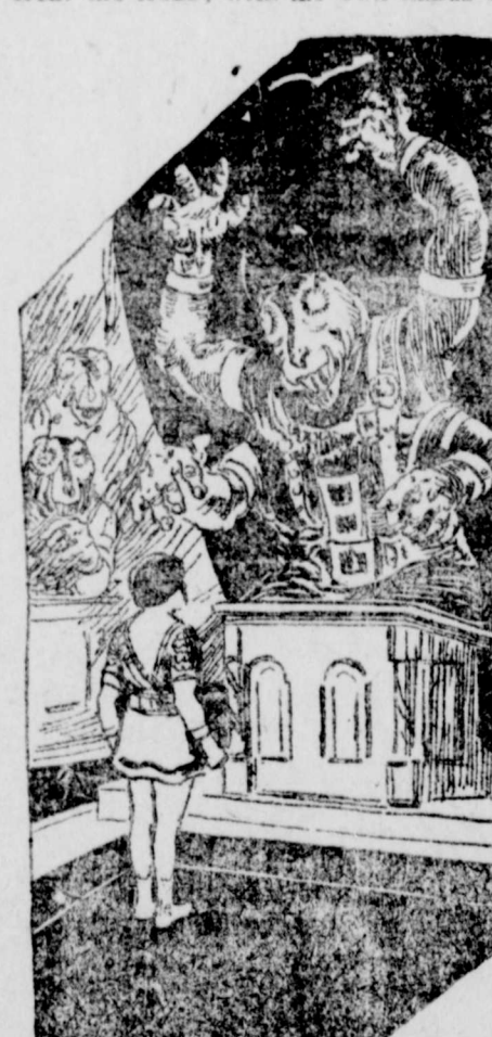
"Heat the Irons; With My Own Hands I Shall Burn the Eyes From His Head."

"Strap him to that pillar," he shricked. "We shall see who it is dares strike the mighty Ta! Hajus. Heat the irons; with my own hands I