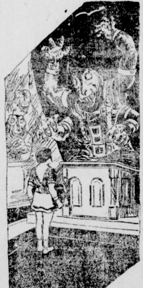
"Heat the irons; With My Own Hands I Shall Burn the Eyes From His Head."

"Strap him to that pillar," he shrieked. "We shall see who it is darest strike the mighty Tal Hajus. Heat the irons; with my own hands I