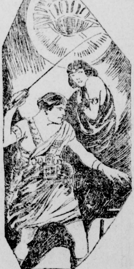
With My Back Against a Golden Throne I Fought Once Again for Dejah Thoris.

All eyes turned in the direction I had indicated, and there, forging