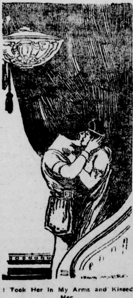
I Took Her In My Arms and Kissed Her.

"The answer is easy, Dejah Thoris," I replied, smiling. "It was not I who