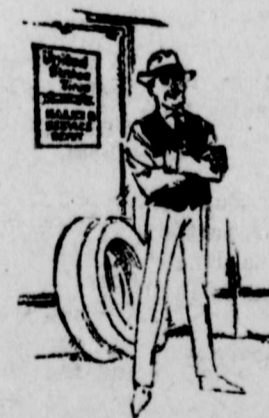
"The most essential man for you to know today in the tire business is your local U. S. Tire Dealer."

Its very simplicity—two diagonal rows of oblong studs, interlocking in their grip on the road—is the result of all the years of U. S. Rubber experience with every type of road the world over.