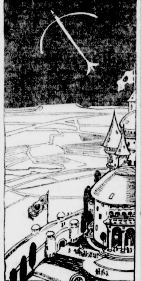
As I Rose Above the City I Circled Several Times as I Had Seen Kontos Kan Do.

They were now almost upon him; their flying mounts charging down on the relatively puny figure at terrific speed, while the warriors leaned low to the right, with their great metalshod spears. Each seemed striving to be the first to impale the poor Zo