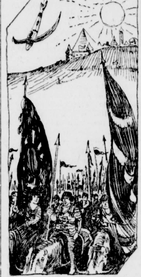
As We Neared the City We Discovered a Mighty Concourse of Civilians and Troops Assembled Upon the Plains Before the City.

One of the staff called the attention of Than Kosis to the presence of my companion above them and the m motioned for him to descend. I can not hear their conversation and presently it ceased and all dismounted, as the last body of troops had wheeled into position before their emperor. A member of the staff advanced toward