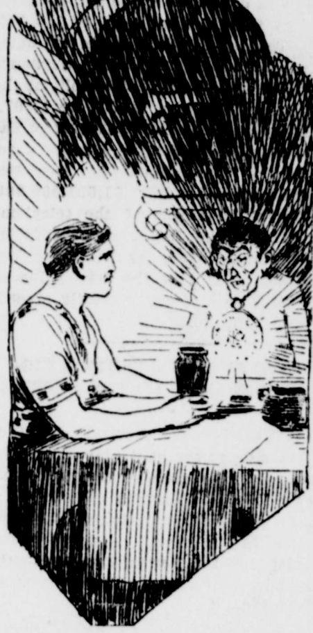
The Old Man Sat and Talked With Me for Hours.

me for hours, and the strangest part of our intercourse was that I could