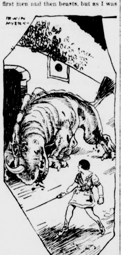
During the Day I Was Pitted Against First Men and Then Beasts.

armed with a longsword and always outclassed my adversary in agility and generally in strength as well, it proved but child's play to me. Time and time again I won the applause of the bloodthirsty multitude, and toward the end there were cries that I be taken from the arena and be made a member of the hordes of Warhoon.