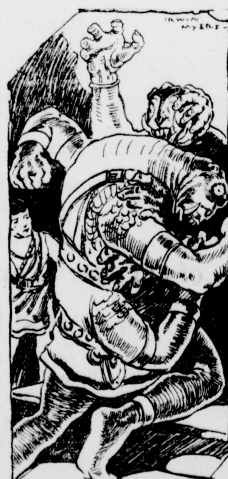
I Never Before Had Seen Two Green Martian Warriors Battle,

I never before had seen two green Martian warriors battle with nature's