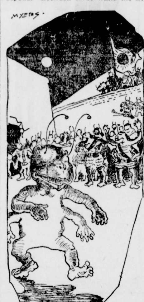
Between These Walls the Little Martians Scampered, Wild as Deer.

On either side of this opening the women and the younger Martians, both male and female, formed two solid walls leading out through the chariots and quite away into the plain beyond. Between these walls the lit-