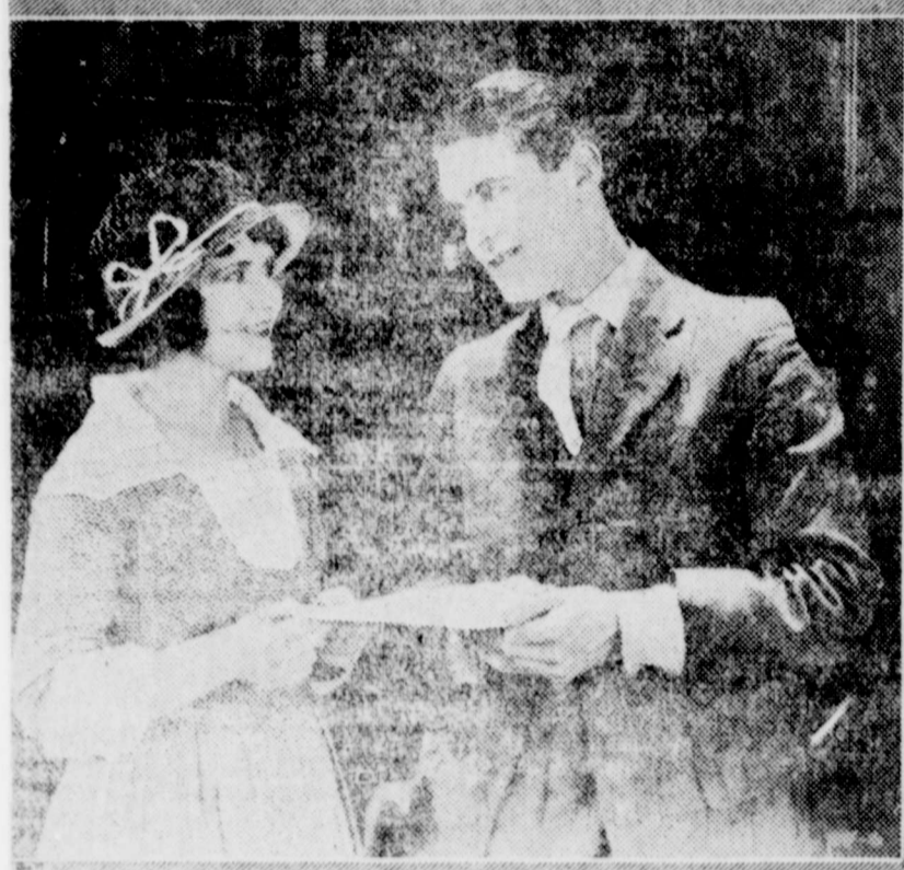
THOMAS H INCE presents "HOMESPUN FOLKS"