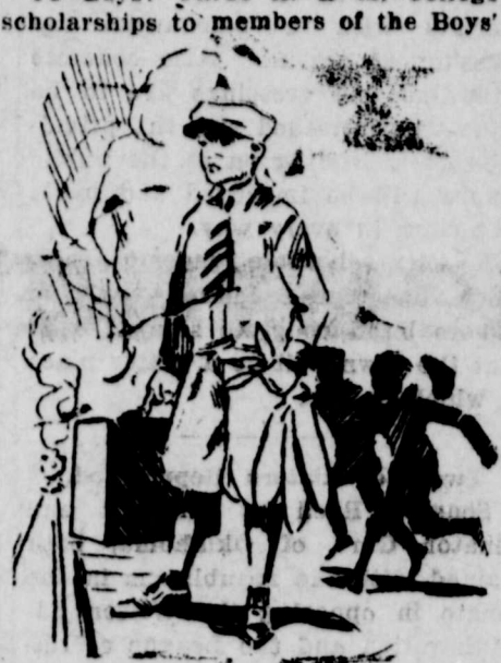
and Girls From Farms Will Be Guests of State Fair