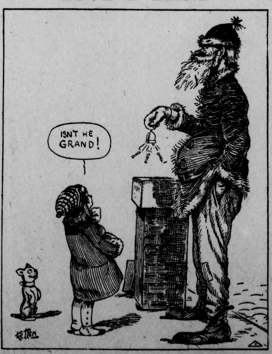
-Ketten in New York Evening World