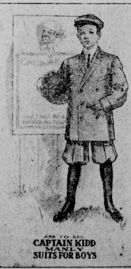
ASK TO SEE CAPTAIN KIDD MANLY SUITS FOR BOYS