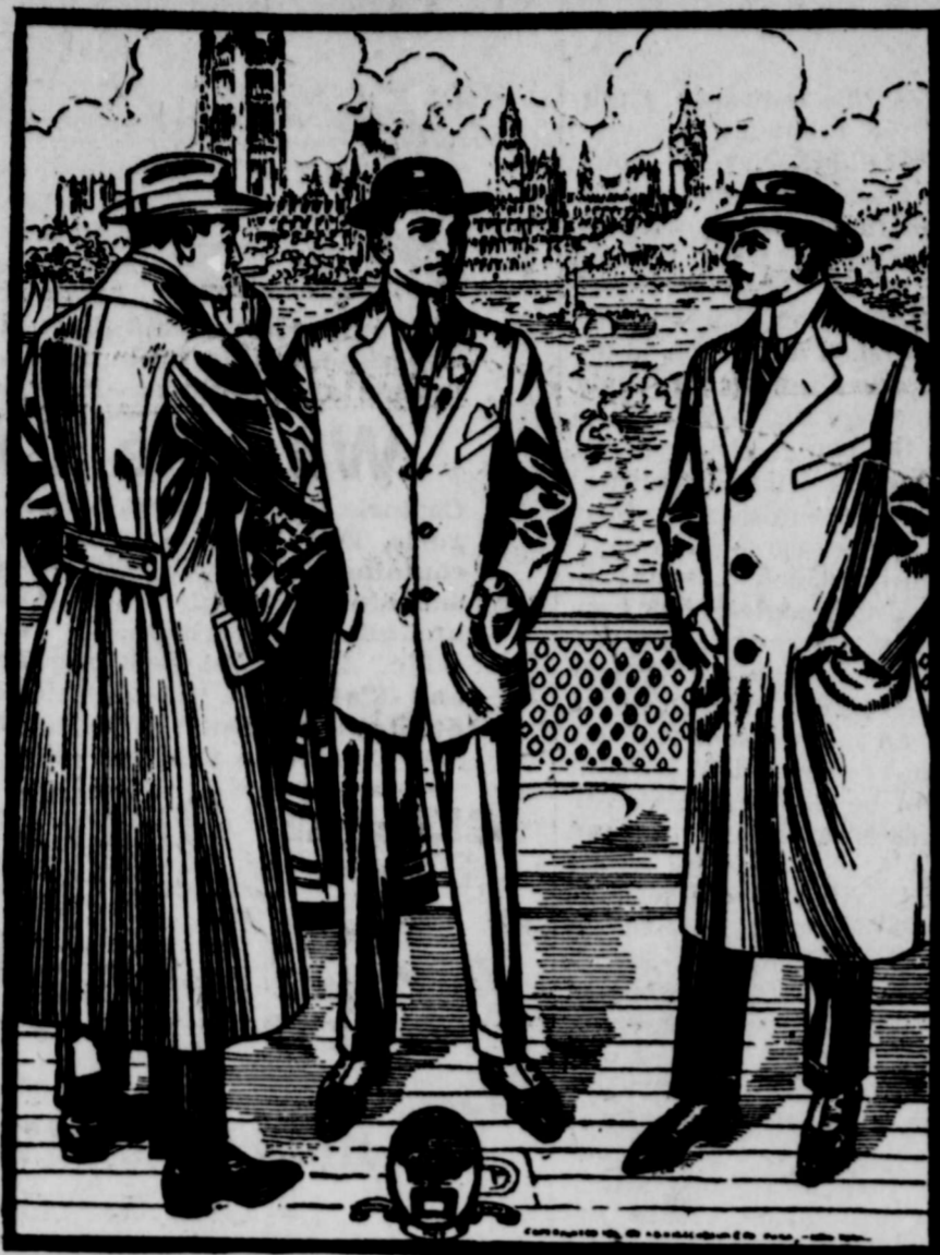
From oil painting of the Houses of Parliament, London. The Kirschbaum models shown (reading from left to right) are the Waldorf Concertable Collar Overcoat; the Dixie Suit and the Dixie Overcoat.

GUARANTEED Kirschbaum Clothes ALL WOOL HAND TAILORED