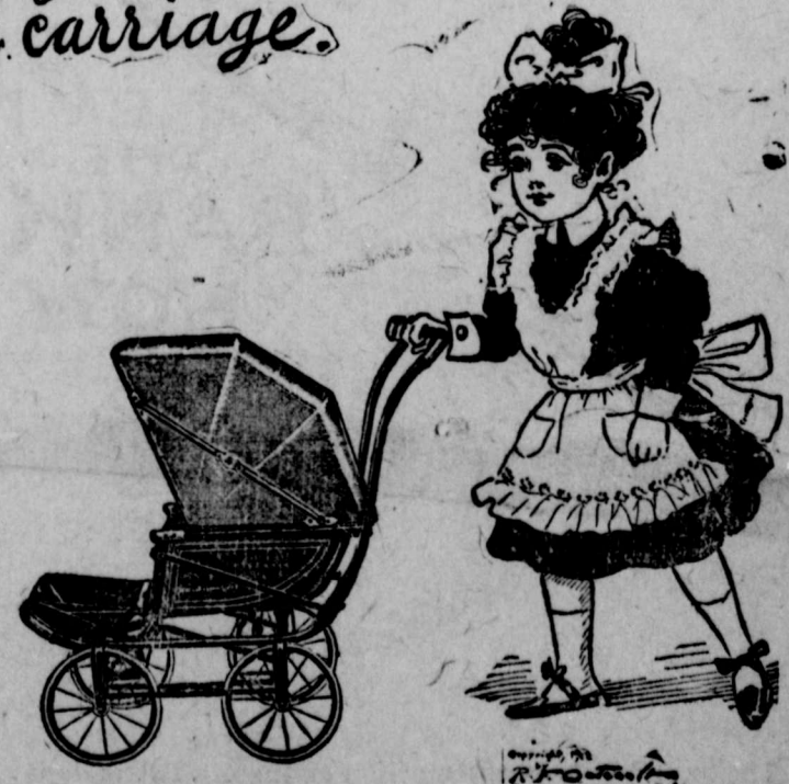
Mrs. New Mother:

little house-maid says a pretty baby should have a pretty carriage.