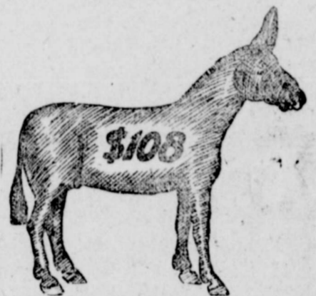
1910 VALUE PER HEAD $108.

The bray of the Texas mule is heard around the world, for wherever he goes he lustily sings the praises of his native land. He is the most sturdy farmer and the most successful miner of the animal kingdom. He is the only animal that did not enter Noah's ark. By good conduct he has overcome the prejudices of an illegitimate lineage and has successfully fought his way into the highways of industry with his parents as competitors, until today he drags the nation's commerce. He is a self-made animal. Year by year he has patiently studied new occupations and adapted himself to changed conditions until he is the master of more industrial pursuits than any other animal and he is by far the Commercial King of Beasts. He has arisen from obscure origin to the wealthiest of domestic animals; he is worth $25 per head more than the horse, six times more than the Texas steer and fourteen times more than the hog.