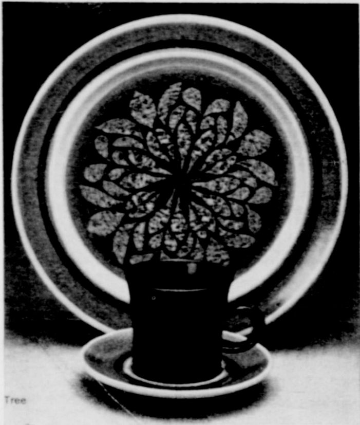
Nut Tree Franciscan Pottery and Michelangelo Stainless Flatware by Oneida