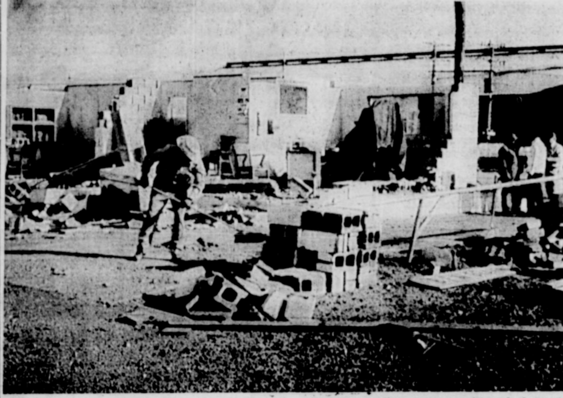
A Claytonville elevator office building was destroyed at 8:30 p.m. Tuesday. Several steel tanks were deposited in new resting places and cotton trailers were overturned. A number of highline poles were splintered off two feet above the ground.

and pea to golf ball size hail in less than 30 minutes. Water was over Highway 86 between Tulia and Silverton in five to seven places. High winds overturned three trailer homes near Tulia and downed power lines. Flooding was reported on US 87 south of Tulia and on FM 1424 southwest of there. Two thunderstorms, 2 1/2 hours apart, dumped up to 1.30 inches of rain near Lockney, and pea and marble size hail reportedly destroyed crops in every direction from that town. A tornado siren was sounded in Lockney as the second storm approached. Water flooded several farm roads and fields following the first rain at 6:30 p.m.