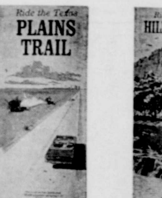
Take the Plains Trail and you'll see a canyon over 100 miles long.

descriptive notes on things and places you never knew existed in Texas! land of contrast.