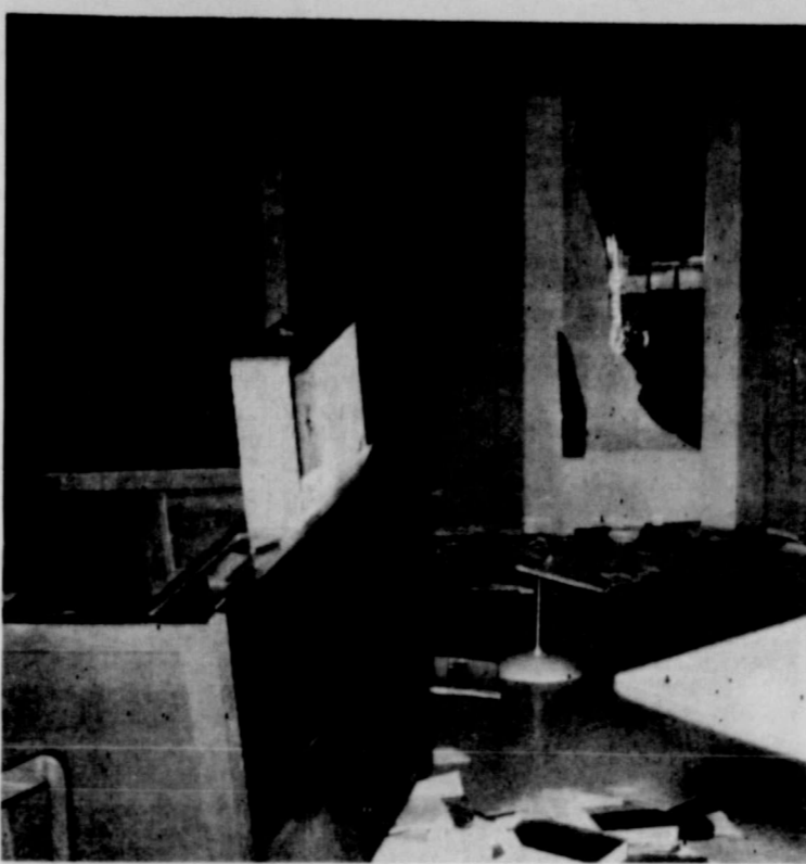
A broken mirror (will this bring seven years of bad luck?), scattered papers and books, overturned desk and chairs are mute testimony to the "evening of fun" which vandals enjoyed in Silverton High School over the weekend.

You'll never get in the headlines sitting on the sidelines.