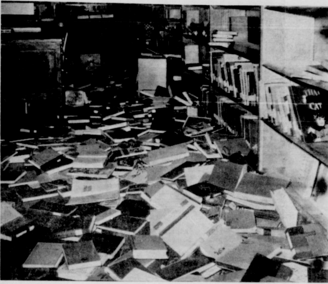
Books, usually carefully shelved according to the Dewey-Decimal System, littered the floor of the Silvertown High School Library Monday morning when students arrived. This was only a part of the disorder wrought by the intrusion of vandals into the school building over the weekend. (See related picture and stories in THE OWL'S HOOT.)

BRISCOE COUNTY NEWS THURSDAY, APRIL 17, 1969 SILVERTON, (Briscoe County) TEXAS VOLUME 61 NUMBER 16