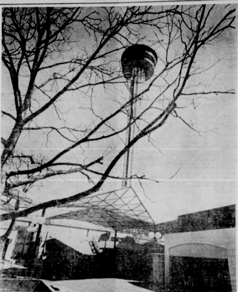
RESTAURANTS UP AND DOWN —Visitors to HemisFair can dine with both feet on the ground or at the top of the 622-foot Tower of the Americas. The canopied food cluster above is one of several food sections on the 92.6-acre grounds, offering appetizing items from every land.

mers to stay in business who otherwise would have had to give up and go to the city. They have helped young farmers get established. They have enabled farmers to keep going after suffering several severe setbacks from hail storms, abnormal freezes and general drought conditions. Farmers Home Administration loans can be used to buy land, refinance debts, acquire livestock and equipment, pay fertilizer and fuel bills and pay other expenses connected with acquiring, improving and operating farms.