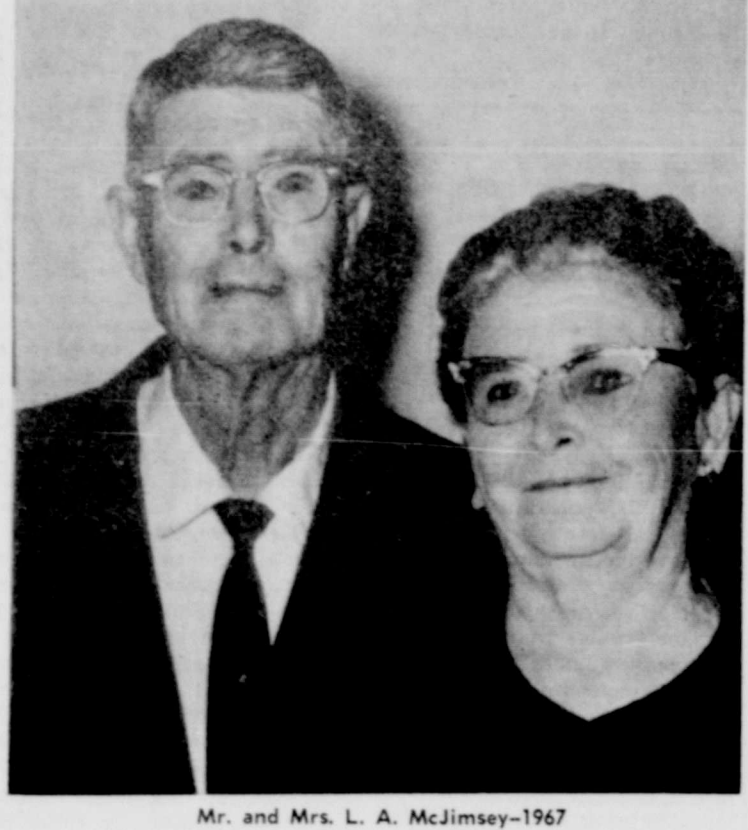
* * * * *