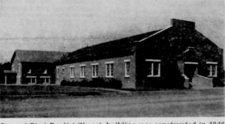
Present First Baptist Church building was constructed in 1946 and the educational building was erected in 1957. The church is engaged in a building program now, and plans to remodel some of the existing structure as well as adding to it.