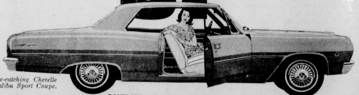
Eye-catching Chevelle Malibu Sport Coupe.