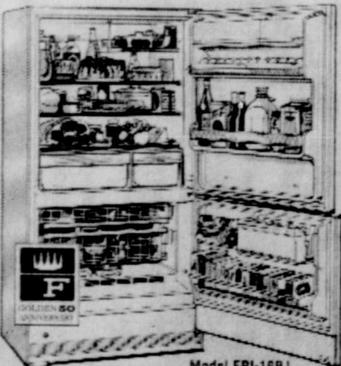
Model FPI-16B 15.9 cu. ft. (NEMA standard), colors or white

171-lb. freezer! Frost-Proof FRIGIDAIRE Refrigerator!