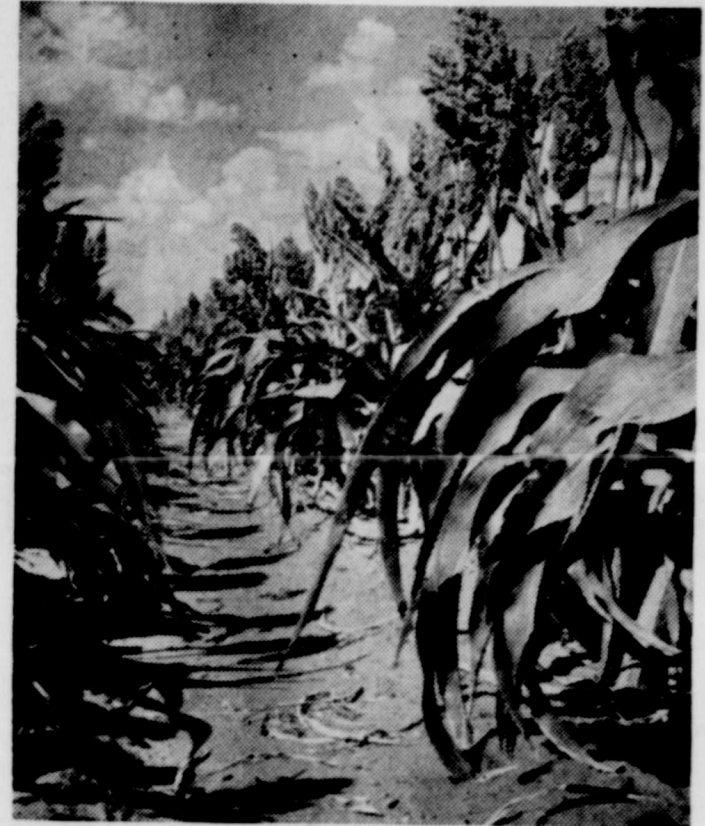
Spray Propazine to control weeds and grasses in sorghum.