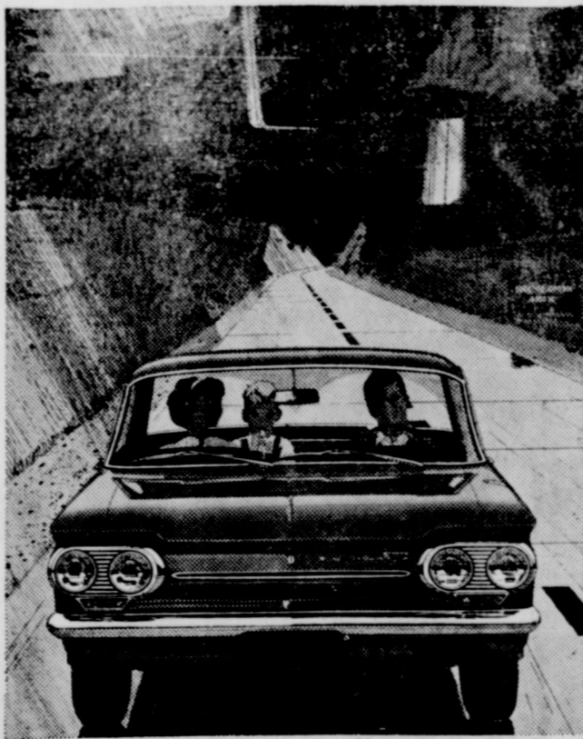
Monza Spyder Club Coupe