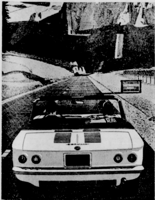
Monza Spyder Convertible