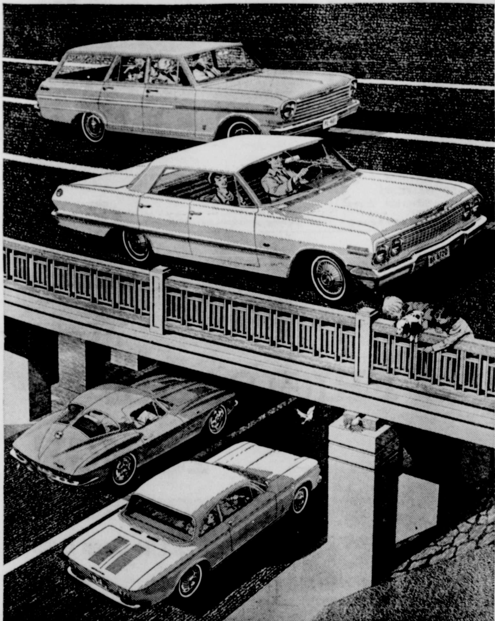
Shown (top to bottom), '63 Chevy II Nova 400 Station Wagon, Chevrolet Impala Sport Sedan, Corvette Sting Ray Sport Coupe and Corvair Monza Club Coupe

expect only in costly cars. Chevy II features parkable size, perky performance and outstanding fuel economy. Corvair gives you rear engine maneuverability and sports car flair. The new Corvette Sting Ray can best be described as dramatic. With a choice of 33 models, there's one Chevrolet that will suit you best.