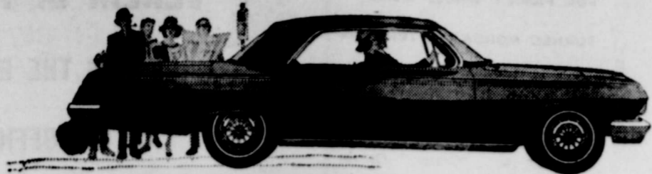
YOUR DEALER'S GOT AUGUST BUYS

The total enrollment for the Junior Girl's camps was 1600.