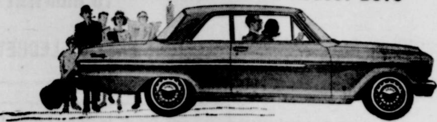
ON NEW CHEVROLETS