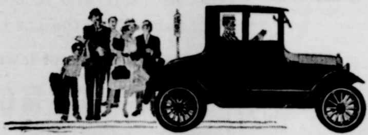
(WELL... ALMOST EVERYBODY) CHEVROLET

Even the most persnickety luxury-lover couldn't ask for very much more than a Jet-smooth Chevrolet (like that Impala Sport Coupe at the top). Yet it's all yours for a Chevrolet price. (And you know how low that is.)