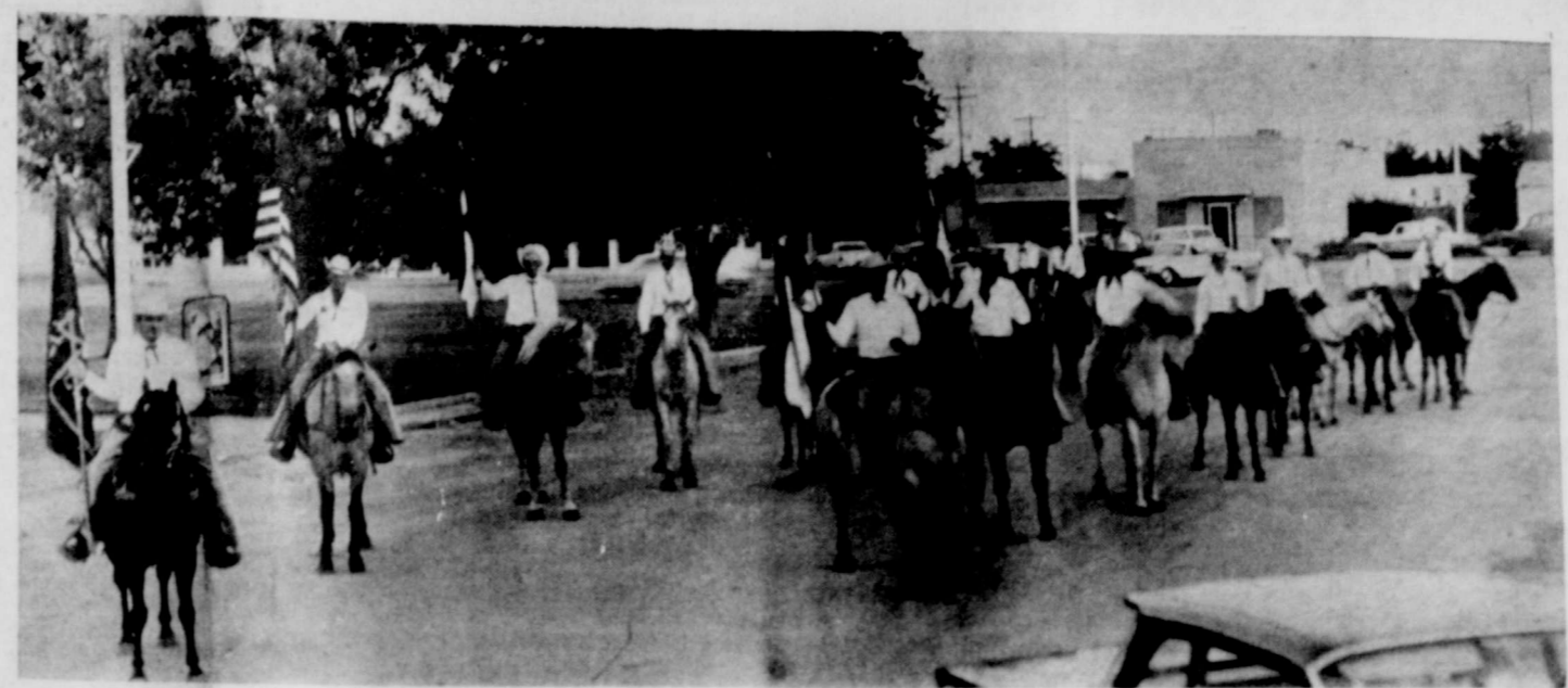
The Silverton Riding Club will be host this weekend to contestants and best riding clubs are on display in the riding clubs from Plainview, Dimmitt, Tulia, Canyon and window of the City Cafe in Silverton. Also on display at City Lone Star. Trophies which will be given to the Rodeo Queen Cafe are the trophies which the Silverton Club has won.