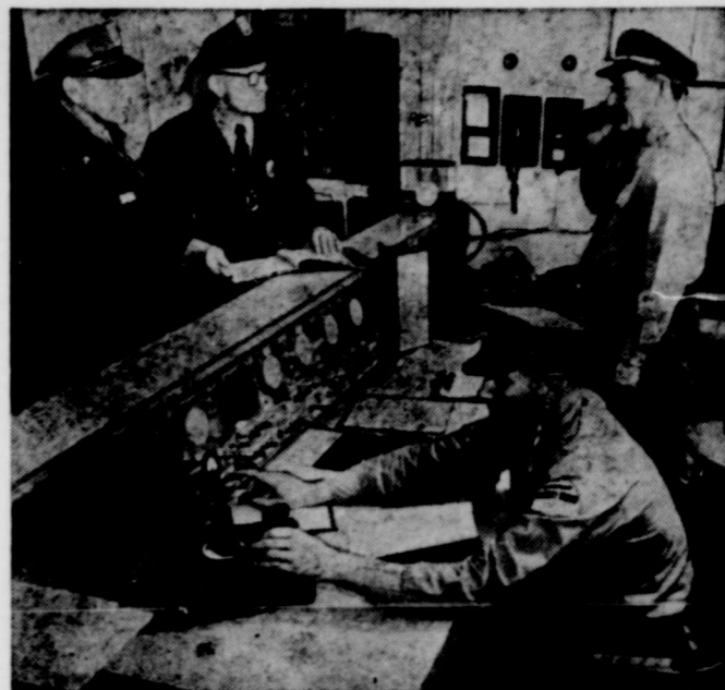
INDUSTRIAL PARTICIPATION in the yearly civil defense Operation Alerts is typified by the Boeing Airplane Co. of Seattle, Wash., which periodically tests its plant disaster plan and will do so during Operation Alert 1961 from April 26-30. In some years all of the firm's 60,000 Seattle-area employees have participated. This is the Boeing Communications Center, heart of an effort to direct employees to evacuate the plant or take cover in the face of enemy attack or other disaster. Pre-recorded instructions are broadcast from here over a complex loudspeaker system which can reach any or all parts of the vast facility. Plant shut-down procedures, medical and rescue teams, and evacuation of planes also are parts of the Boeing disaster plan.