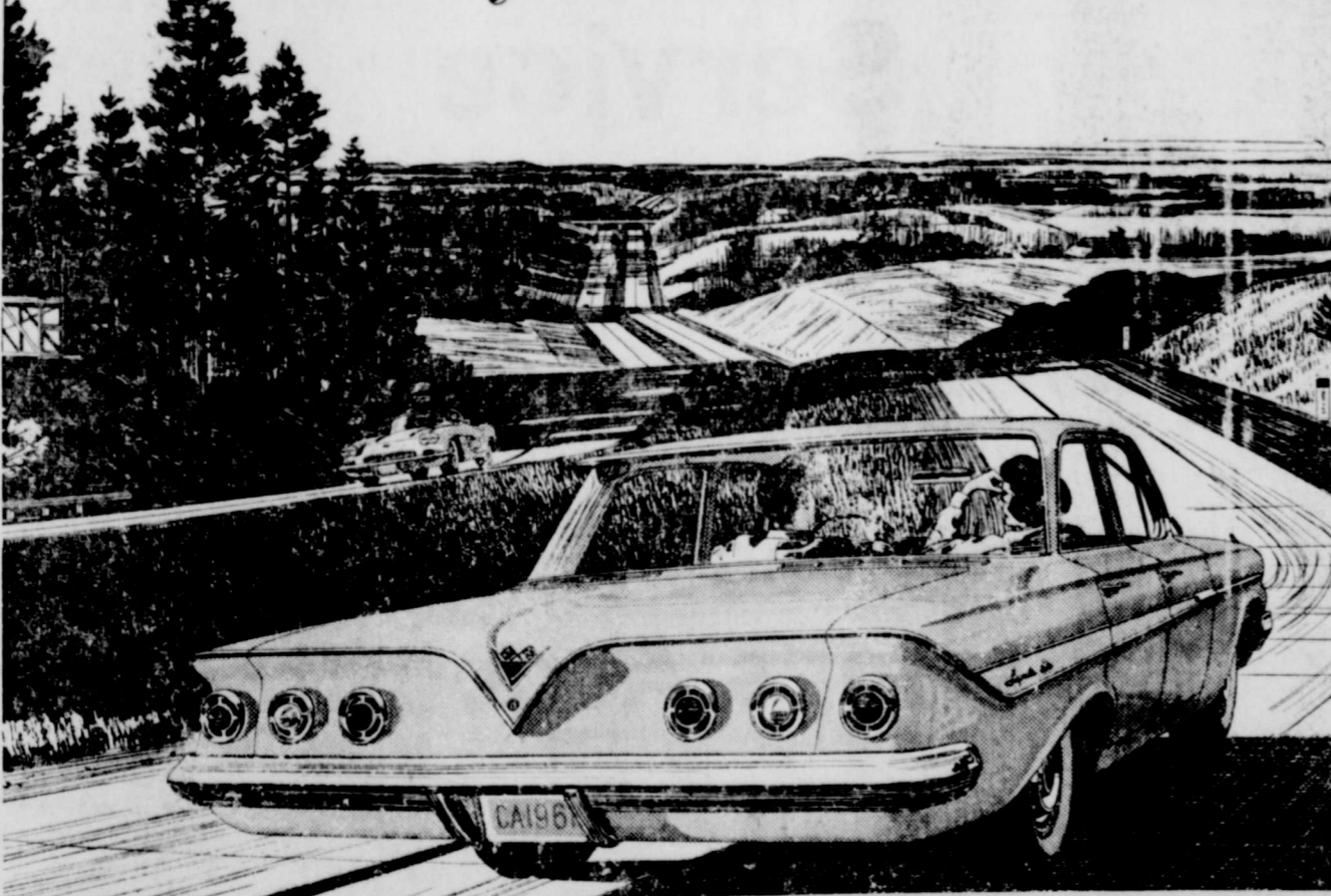
Impala 4-Door Sedan—Jet-smooth traveler that rivals the luxury cars in everything but price

The '61 Chevy loves to go because it goes so well. Purrs along pavements like a happy tabby. Takes rough roads in stride and all roads in style. Just why does a Jet-smooth Chevy treat riders as royally as the high-priced luxury cars? It all came about through a delightful blend of Full Coil suspension, precision-balanced wheels, unique chassis cushioning, and a superb Body by Fisher insulated to hush away road sounds. All this adds up to less sway, less jounce, less dip, less dive, less tilt, less noise, less... well you name it. Now combine this Jet-smooth ride with conveniences to pamper you and roominess to relax in. Add a full measure of quiet good looks. Voila , you've got Chevy's formula. And the proof is in the riding. When you sample a Jet-smooth Chevy at your Chevrolet dealer's we think you'll find it just to your taste.