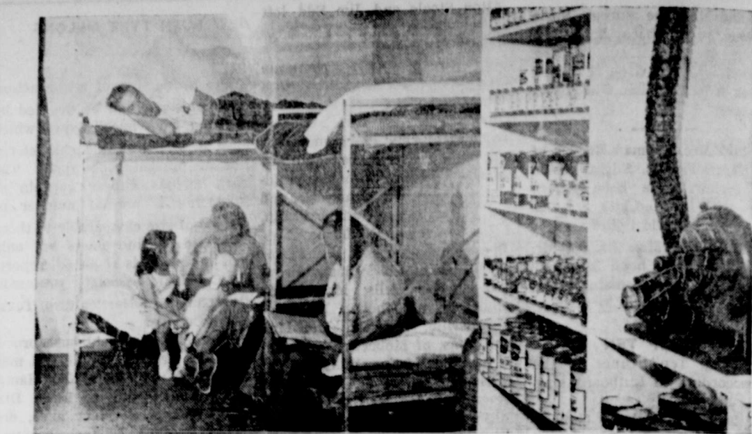
FALLOUT SHELTERS are the best way for rural Americans to protect themselves from a massive nuclear attack which could unleash dangerous radioactive fallout throughout the country. Some of the shelters recommended by the Office of Civil and Defense Mobilization are not as elaborate as this one, which includes an auxiliary generator and an electric air filtering and ventilating system. However, all recommended shelters should include the basic features shown here—a place to sleep; food, water and medical supplies, and at least eight inches of concrete or an equal weight of other materials for shielding the shelter against fallout. Free designs may be obtained by writing to OCDM Rural Civil Defense, Battle Creek, Mich.