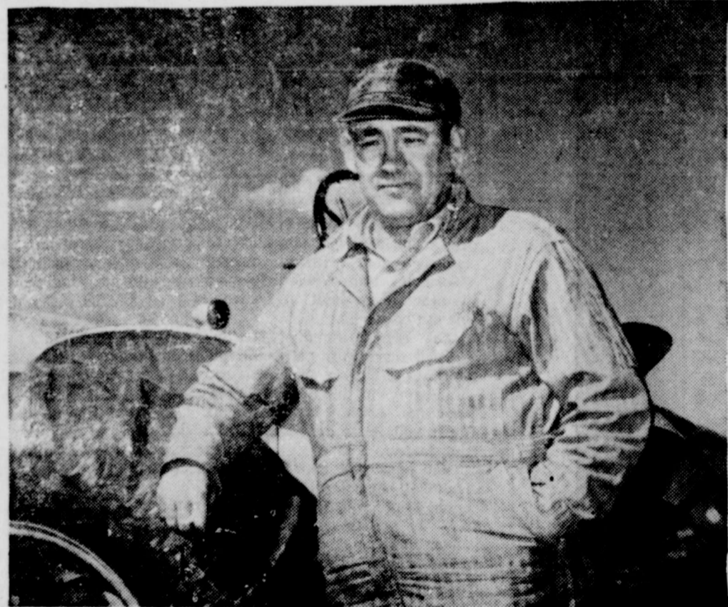
Nazareth, Texas, Farmer Reports—