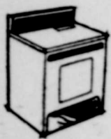
You'll find this a good idea, too, to invest in a Gas Clothes Dryer. You'll find outstanding values on the make and model of your choice.

Now's the BEST time to trade for a NEW GAS RANGE!!!