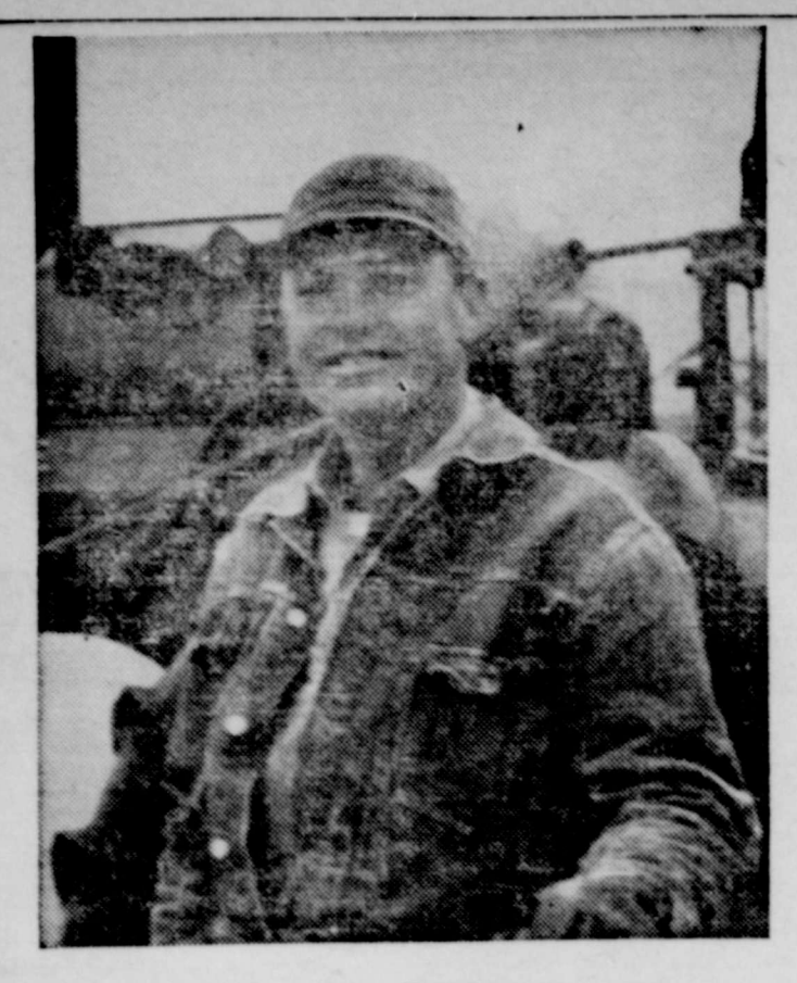
Hale Center, Tex., Man Reports-