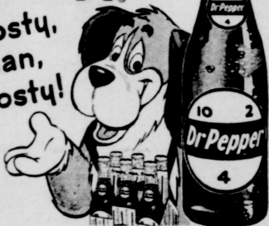
Copyright Dr. Pepper Co. 1958