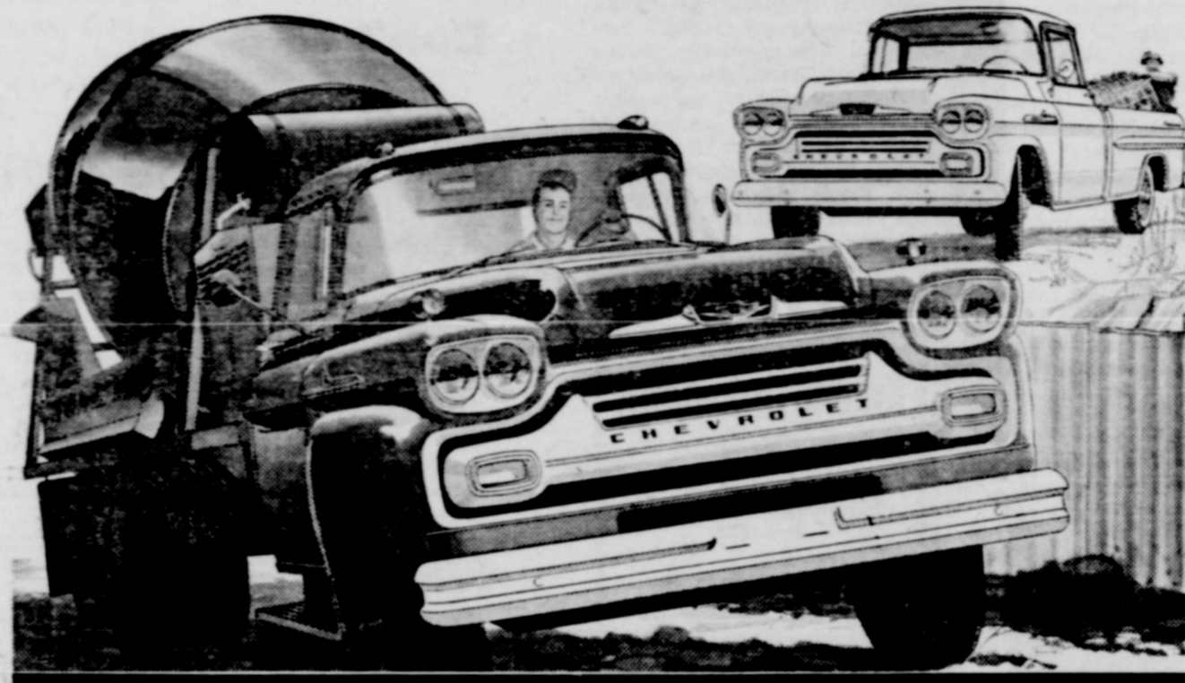
Heavy-duty 100 Series tandem (foreground) and Fleetside pickup.