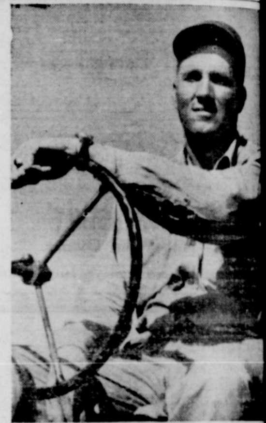
Dimmitt, Tex., Man Reports—