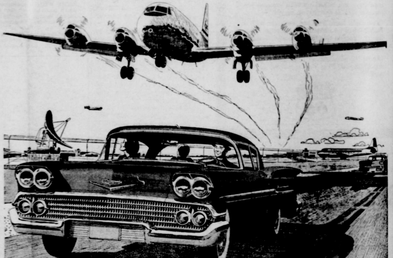
The Escalade 2-Door Sedan with Body by Fisher. Every window of every Chevrolet is Safety Plate Glass.

America's best buy— CHEVROLET America's best seller!