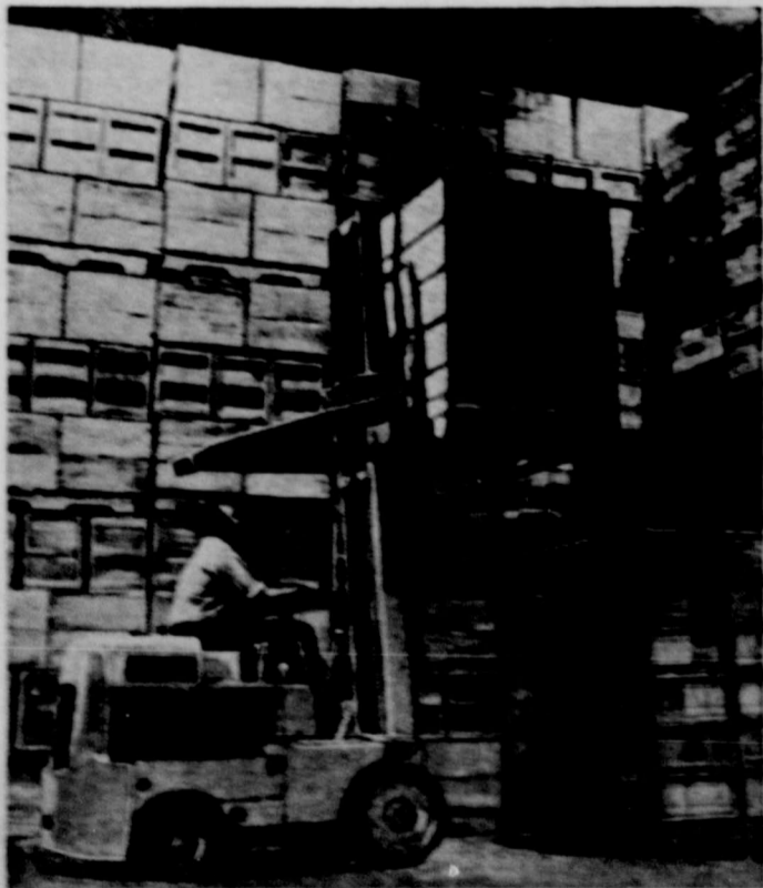
CIVIL DEFENSE warehouse worker at Lebanon, Pa., stacks cases of medical supplies, part of a vast store kept in Office of Defense and Civilian Mobilization warehouses against the day when enemy attack might leave millions of Americans injured.