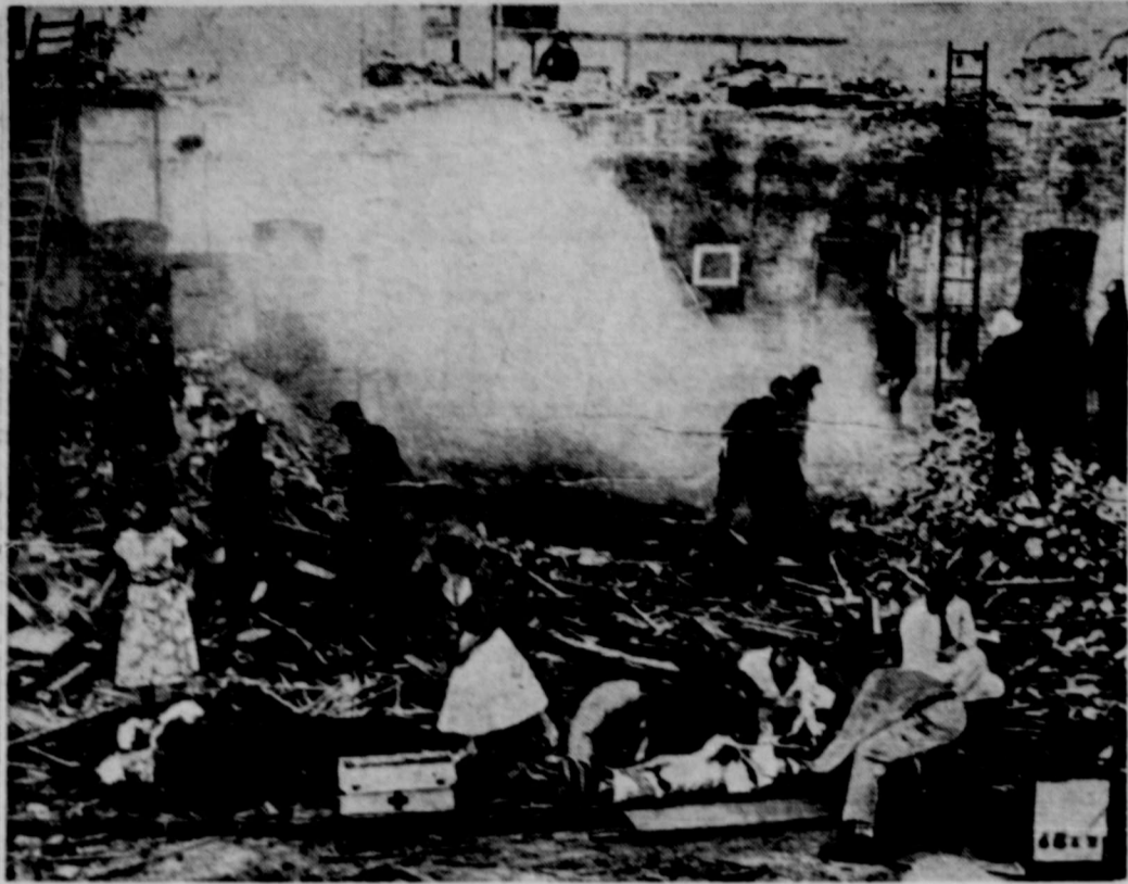
DISASTERS, natural or man-made, call for immediate stocks of medical supplies and often other equipment for furnishing safe drinking water, electricity or other essentials in order to save lives and aid the victims. Civil defense stock-

...piles of litters and other supplies are located in 43 fully-manned U. S. warehouses for use in times of national emergency or major natural disaster on presidential approval when other supply sources are exhausted.