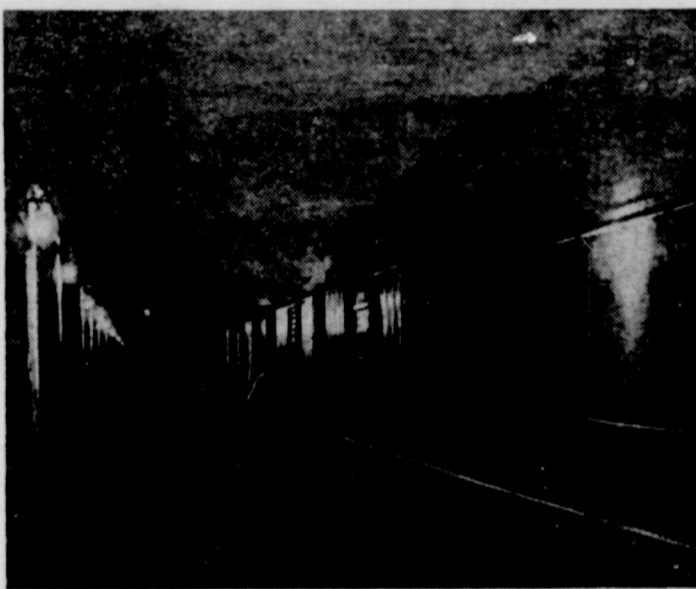
DEEP WITHIN a mountain in southwestern Missouri, freight cars await unloading of civil defense equipment to be stockpiled there for use in case of enemy attack. The siding, extending 600 feet into the mountain, can accommodate 16 railroad cars simultaneously. The Office of Defense and Civilian Mobilization facility, part of a limestone mine, contains a vast array of medical supplies and "hardware" to be used in recovery operations in the event of an attack on the United States.