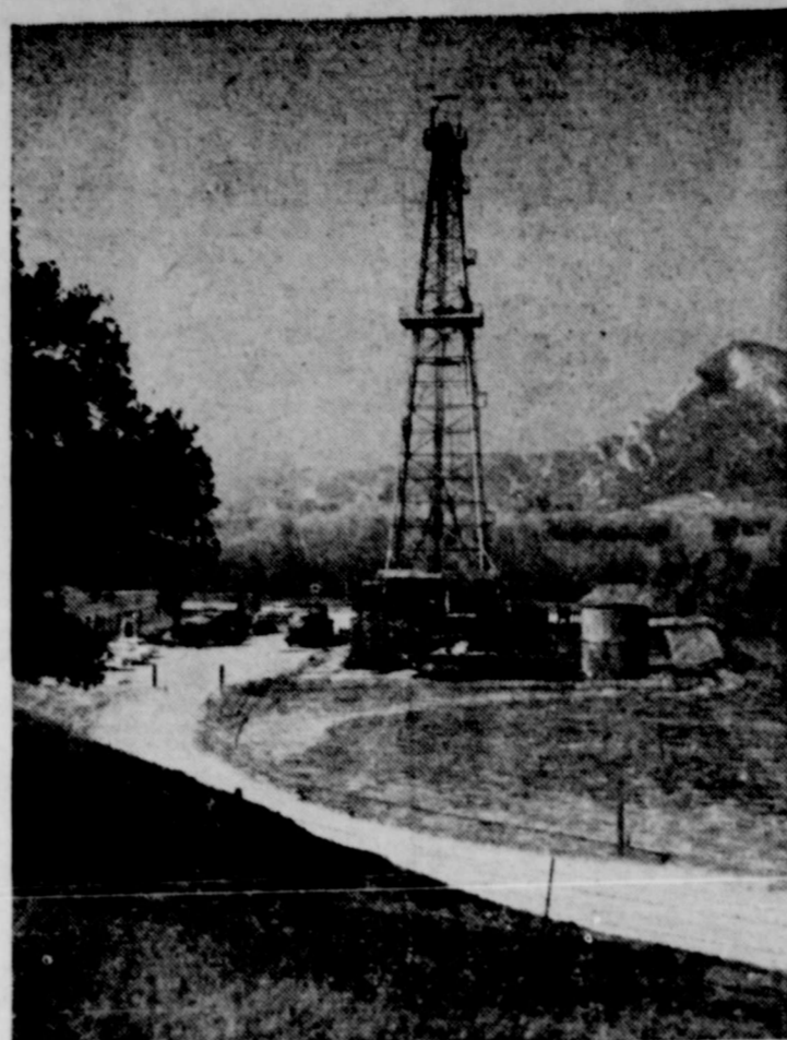
HUMBLE'S DRILLING COSTS UP —The annual report of Humble Oil & Refining Company reveals that the company's average cost of drilling a well like this in 1957 was $170,600, almost 30 per cent more than in 1956. Total drilling costs for Humble last year were $146 million, of which 42 per cent was spent in drilling wells that failed to produce either oil or gas. These dry holes, one of the expensive risks of exploratory drilling, cost Humble $62 million.