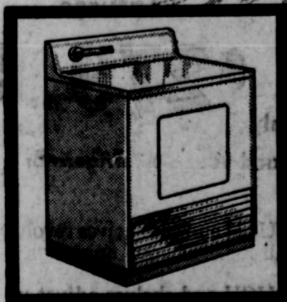
You're sitting pretty with an electric clothes dryer. Reddy Kilowatt does all the hard work... eliminates all the bending, stretching, stooping and the carrying of heavy baskets of wet clothes.

Our area has a great climate — plenty of life-giving sun — great for sun bathing or basking on a sunny afternoon. But, unfortunately, our climate is not very kind to our clothes. The sun, which feels good to the skin, treats clothes harshly. It quickly fades out the colors, takes the life out of a bright print. You can "beat the sun," keep your lovely colors looking pretty, with an electric clothes dryer — the proven way to dry clothes and with ease.