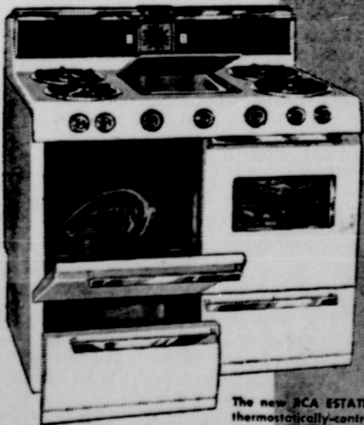
The new PCA ESTATE gas range with thermostatically-controlled top burner.

the possibility of boil-overs and scorching on the range top. And Old Stove Round-up is the time to buy. Better deals... bigger selections... easier terms! Visit your gas appliance dealer, now!