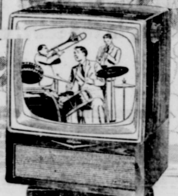
The Edgemont Deluxe. Mahogany grained or lined oak grained finishes. Model 210723.