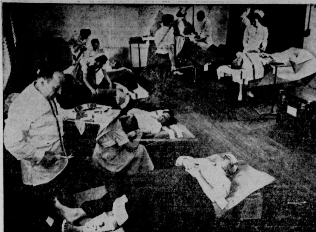
EMERGENCY HOSPITAL scenes like this would be duplicated across the nation if the assumed toll of "dead" and "injured" during Operation Alert 1956 were not merely "paper casualties." The 200-bed emergency hospital, including part of the sorting (triage) area shown here, has been designed by the FCDA to be moved into disaster areas and set up on short notice. It is complete with X-ray, operating room and other usual hospital equipment.