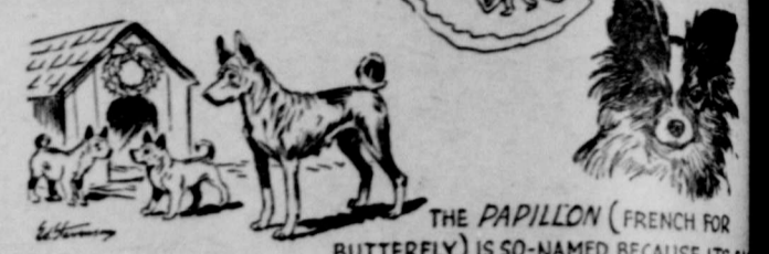
THE PAPILLON (FRENCH FOR BUTTERFLY) IS SO-NAMED BECAUSE ITS RESEMBLE OUTSPREAD BUTTERFLY WINGS

99% OF BASENJI PUPPIES ARE BORN DURING THE MONTHS OF NOVEMBER AND DECEMBER