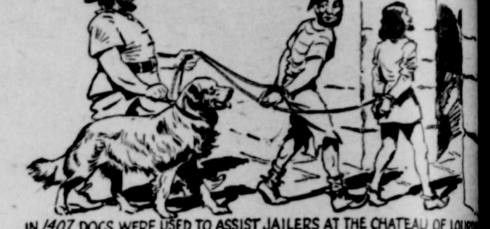
IN 1407, DOGS WERE USED TO ASSIST JAILERS AT THE CHATEAU OF LOURDES