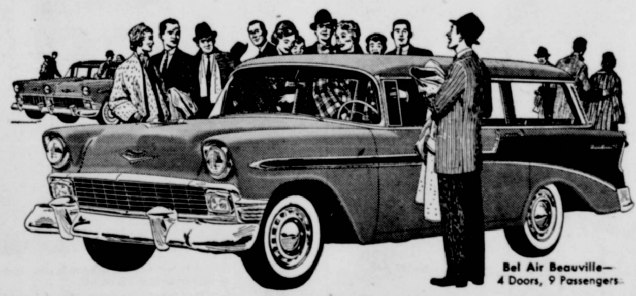
Bel Air Beauville—4 Doors, 9 Passengers.

Chevrolet offers you a choice of six sprightly new station wagons—including two new 9-passenger models—all with beautiful Body by Fisher, all with plenty of cargo space, all with new horsepower ranging up to a hot 205!