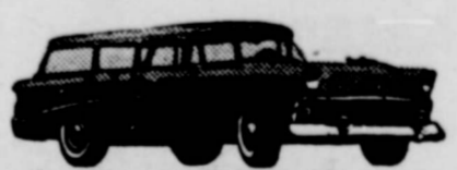
"Two-Ten" Beauville—4 Doors, 9 Passengers

Here's a zippy, exciting kind of power that's fun to handle. And the closest thing to sports car performance—split-second steering reaction and the knack of holding fast around curves—that you'll find in a full-size automobile. Seat belts, with or without shoulder harness, and instrument panel padding, are optional at extra cost. Safety door latches and directional signals are standard. Come in soon and drive a real road car!