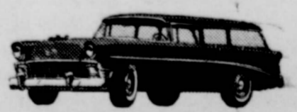
"Two-Ten" Townsman—4 Doors, 6 Passengers