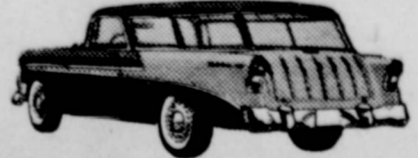
Bel Air Nomad—2 Doors, 6 Passengers