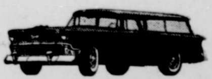
"One-Fifty" Handyman—2 Doors, 6 Passengers