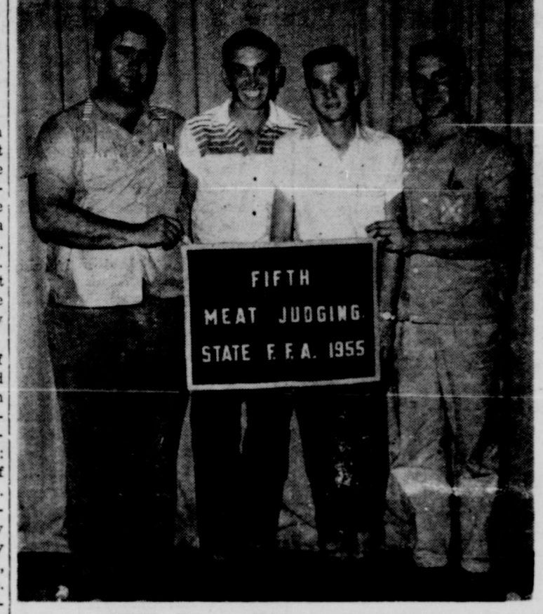
5TH. Place Winners At State

The Century of Progress Study ing group with a slogan of "Slow this week to kick off the pre-