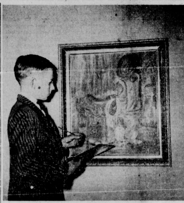
From A Twelve Year Old's Brush . . .