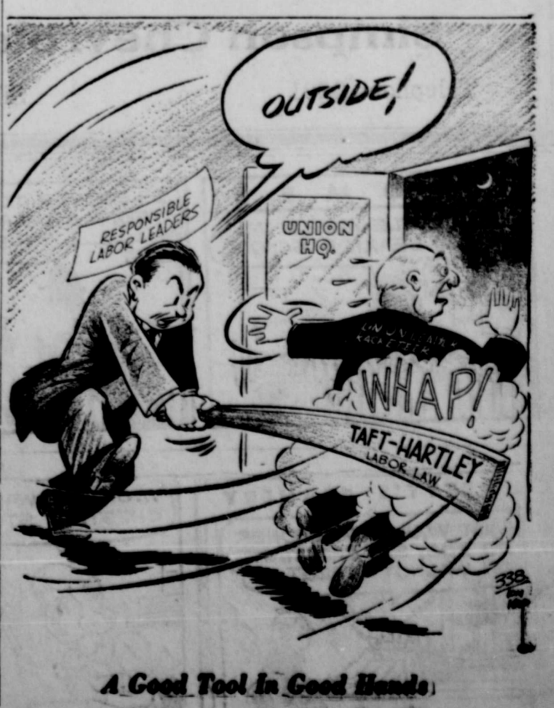
A Good Tool In Good Hands