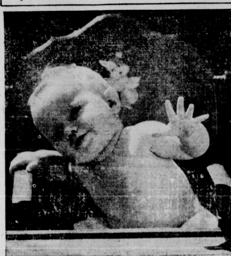
It's hard to predict which way baby will lean. But if you use fast flash bulbs, you can stop the motion without a blur.