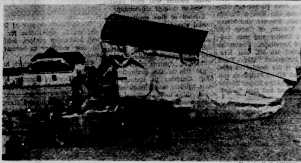
Engraving By Amarillo Daily News