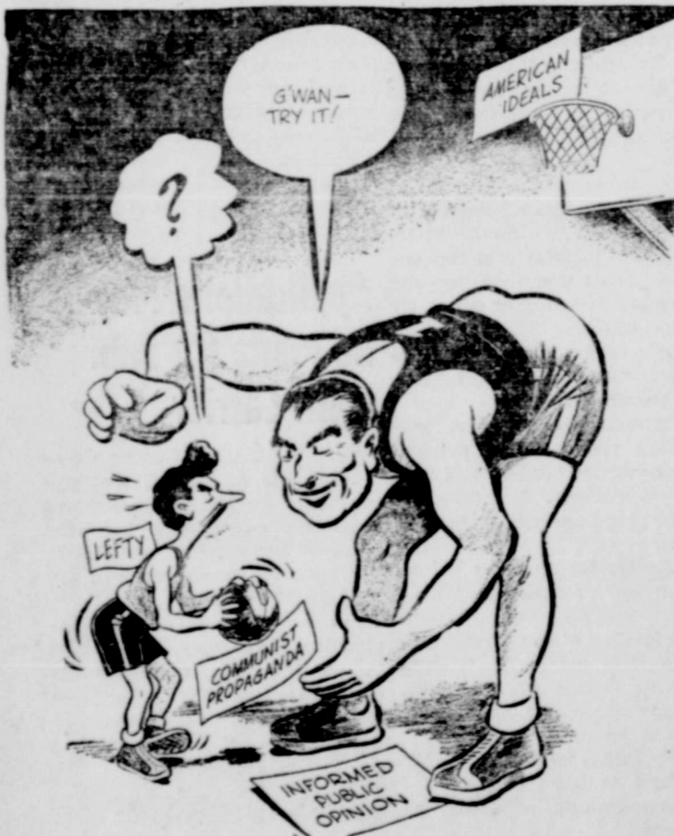
An Informed Public Is An Impregnable Defense