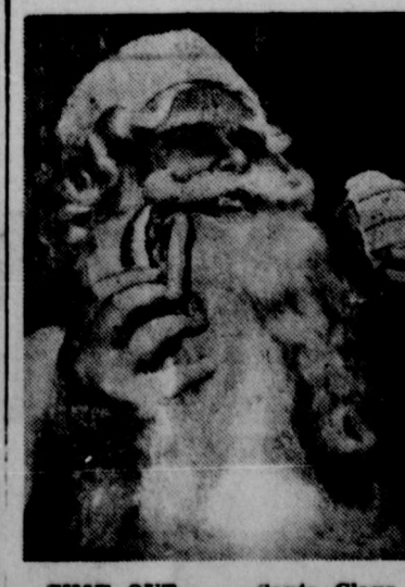
in his Christmas Eve